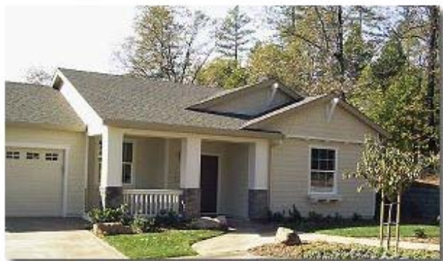
Kitchen ~ Living Room

Single story home, two bedrooms, two baths, great room, covered porch, and two-bay garage. Approximately 1278 sq. ft.