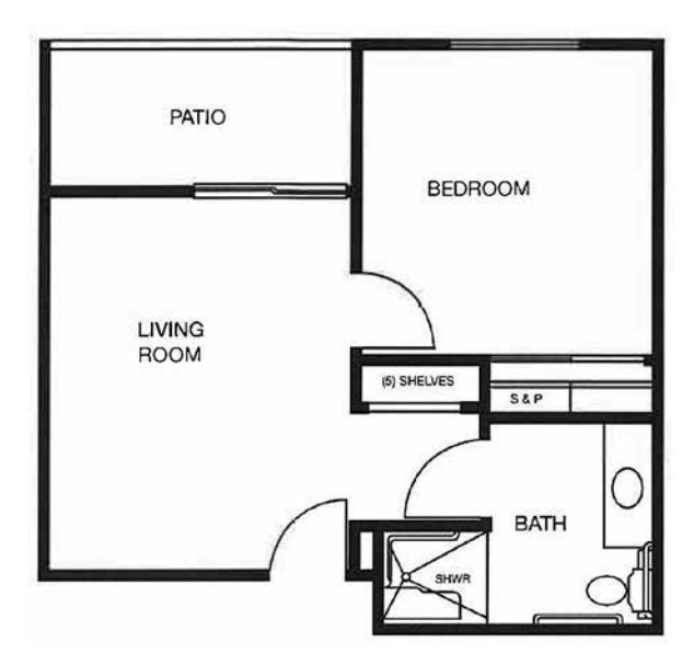
One Bedroom (Assisted Living) 478 sq. ft.