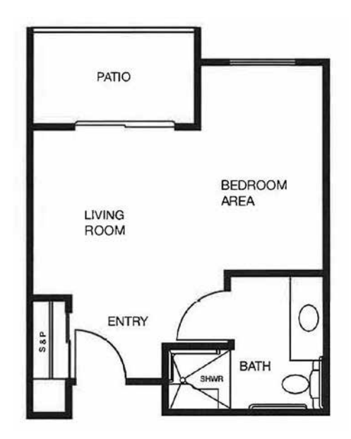
Studio (Assisted Living) 344 sq. ft.