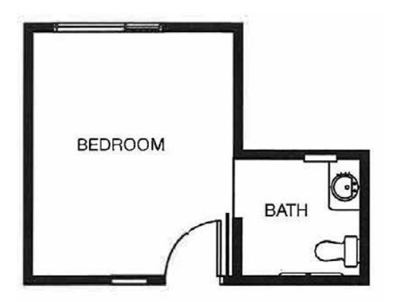
Plan F (Memory Care) 218 sq. ft.